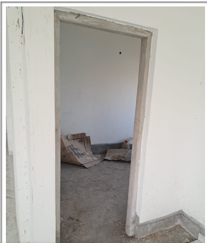
Three unfinished student rooms. Each room will cost Rs. 57,600/- ($1800), to complete.