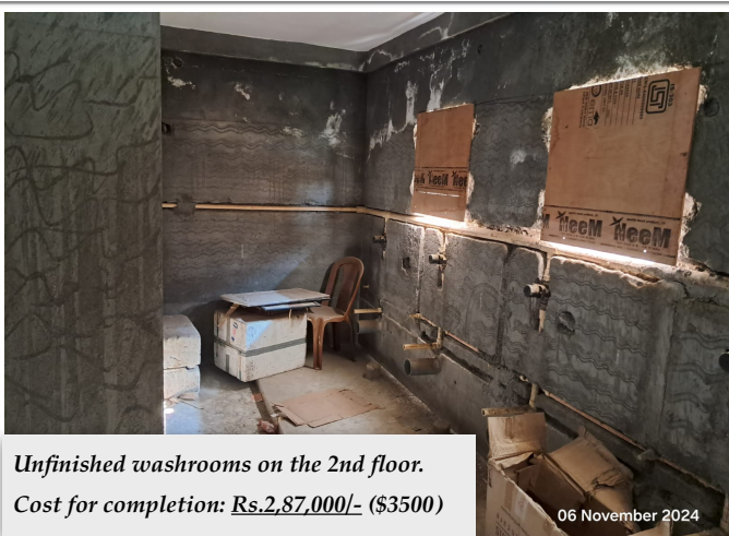
Unfinished washrooms on the 2nd floor. Cost for completion: Rs.2,87,000/- ($3500)