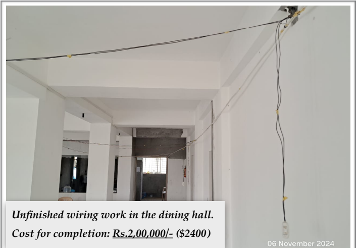
Unfinished wiring work in the dining hall. Cost for completion: Rs.2,00,000/- ($2400)