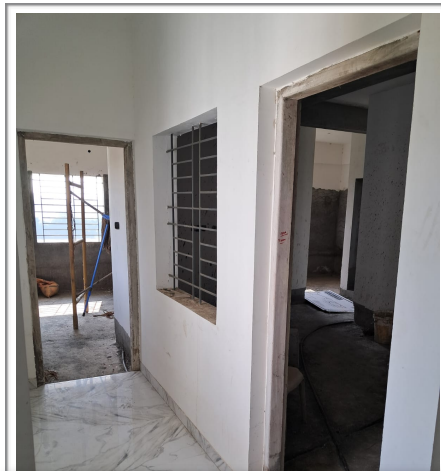
Unfinished 1BHK studios for students with families. Cost for completion: Rs.4,92,000/- ($6000)